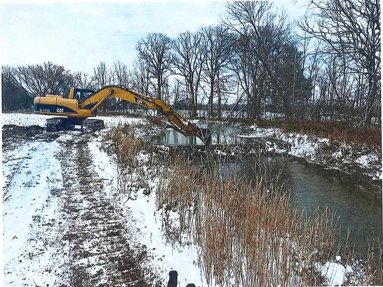
Waldo Drain Beaver Dam